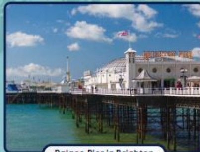
Palace Pier in Brighton