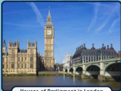
Houses of Parliament in London

A ferry port in Kent , on the coast of the English Channel