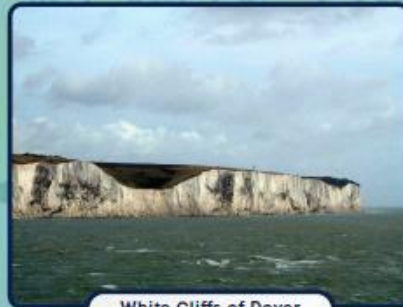
White Cliffs of Dover