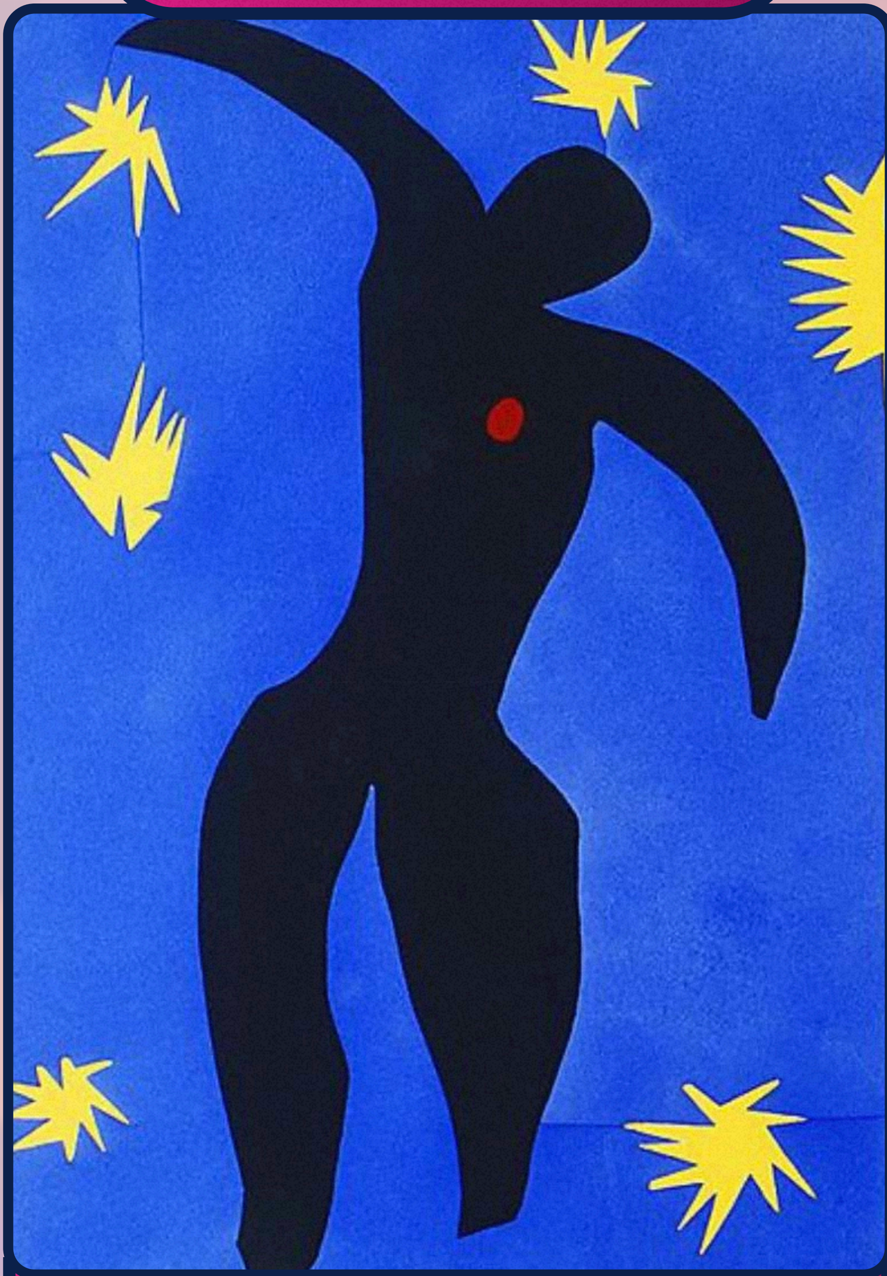
The Fall of Icarus, 1947

© 2021 Succession H. Matisse / Artists Rights Society (ARS), New York