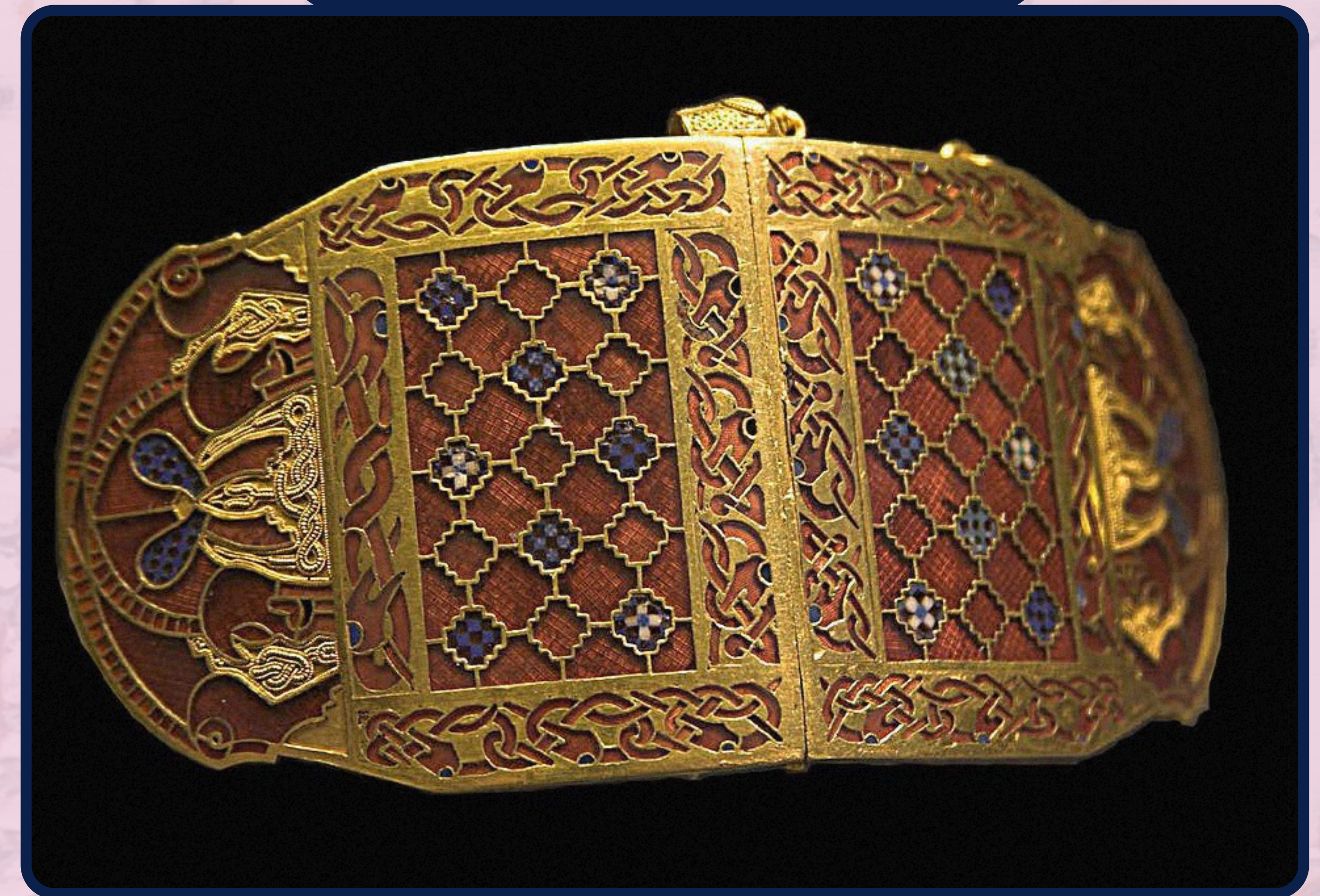
Shoulder clasp found at Sutton Hoo