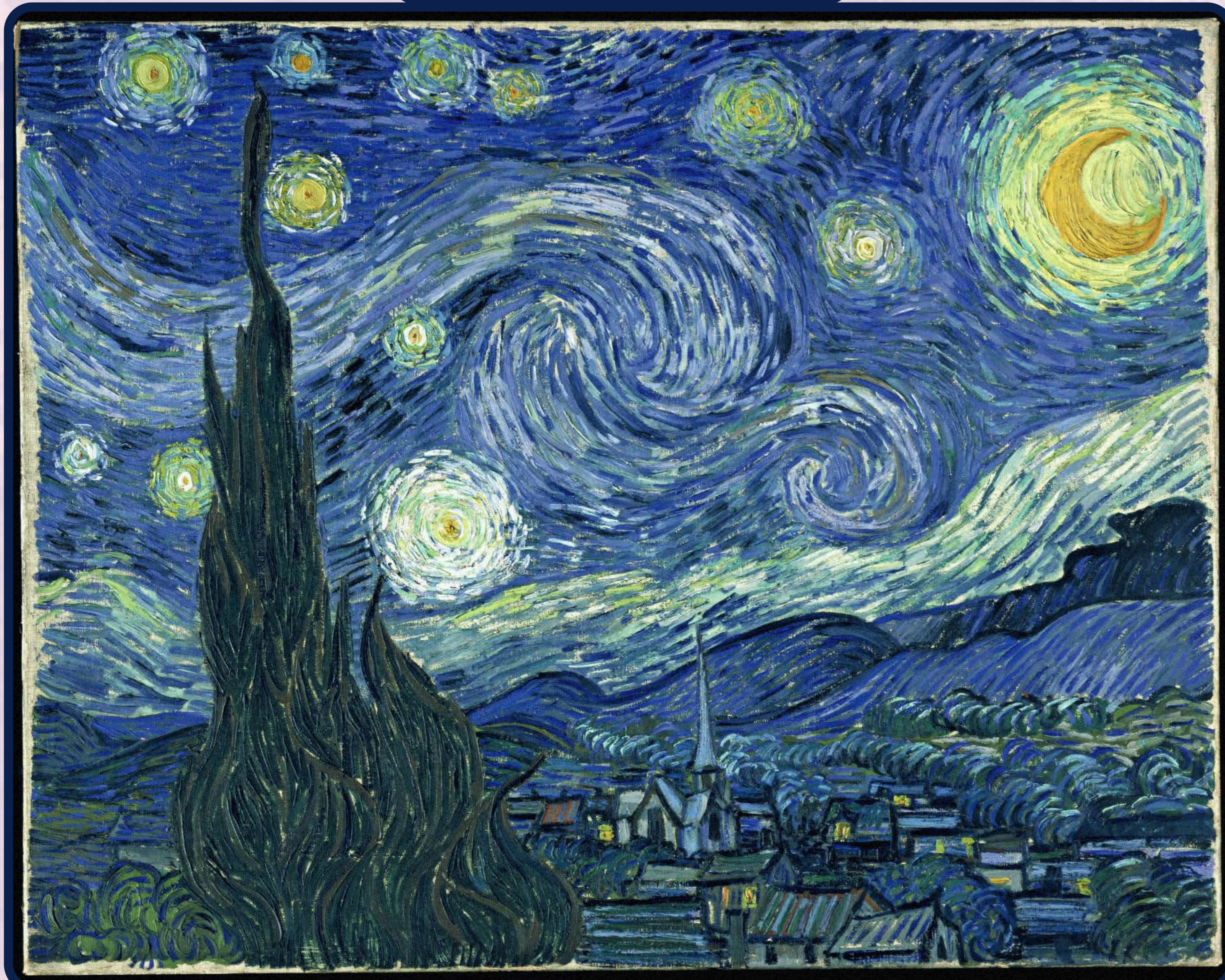
The Starry Night (1889)