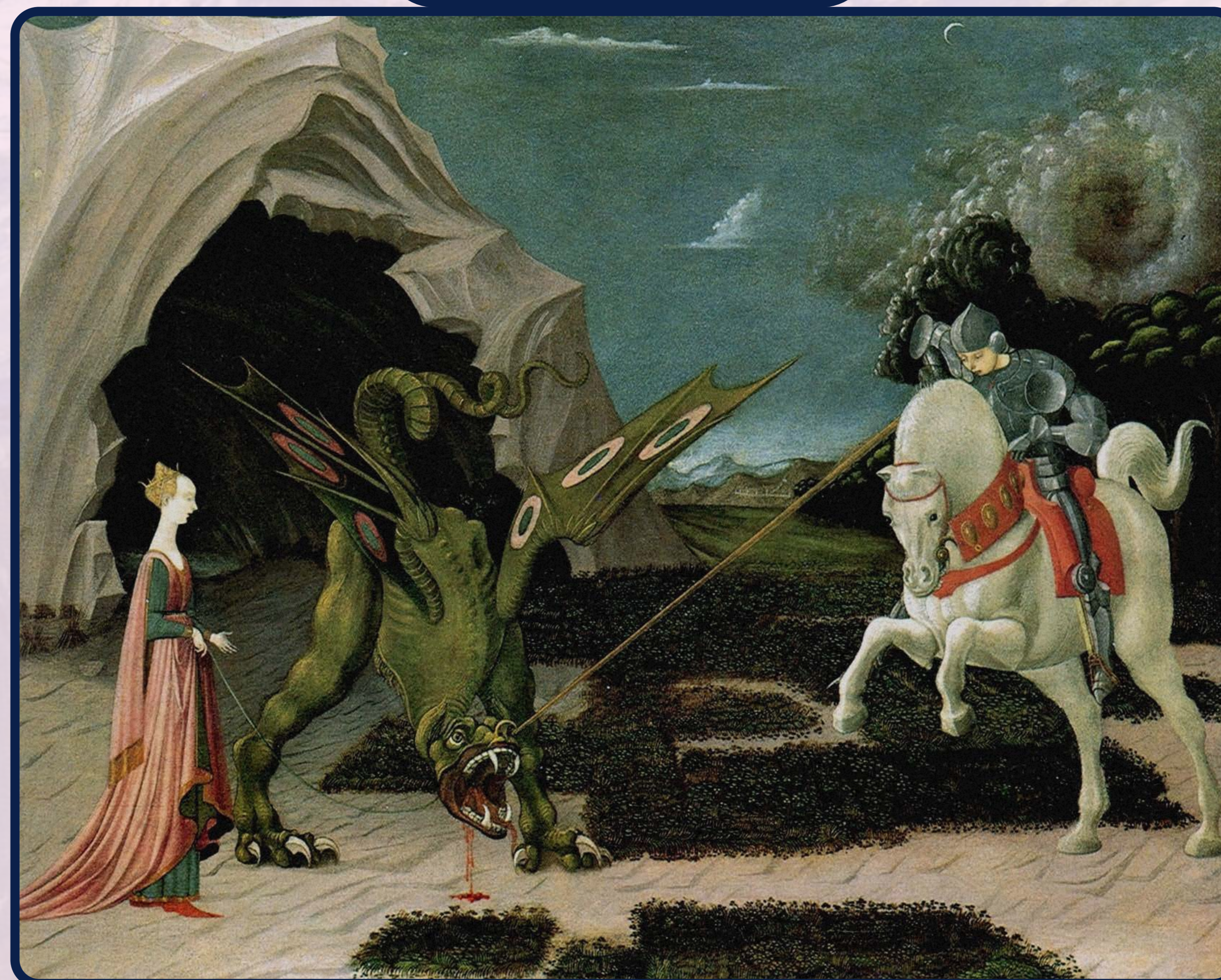
St George and the Dragon (1470)